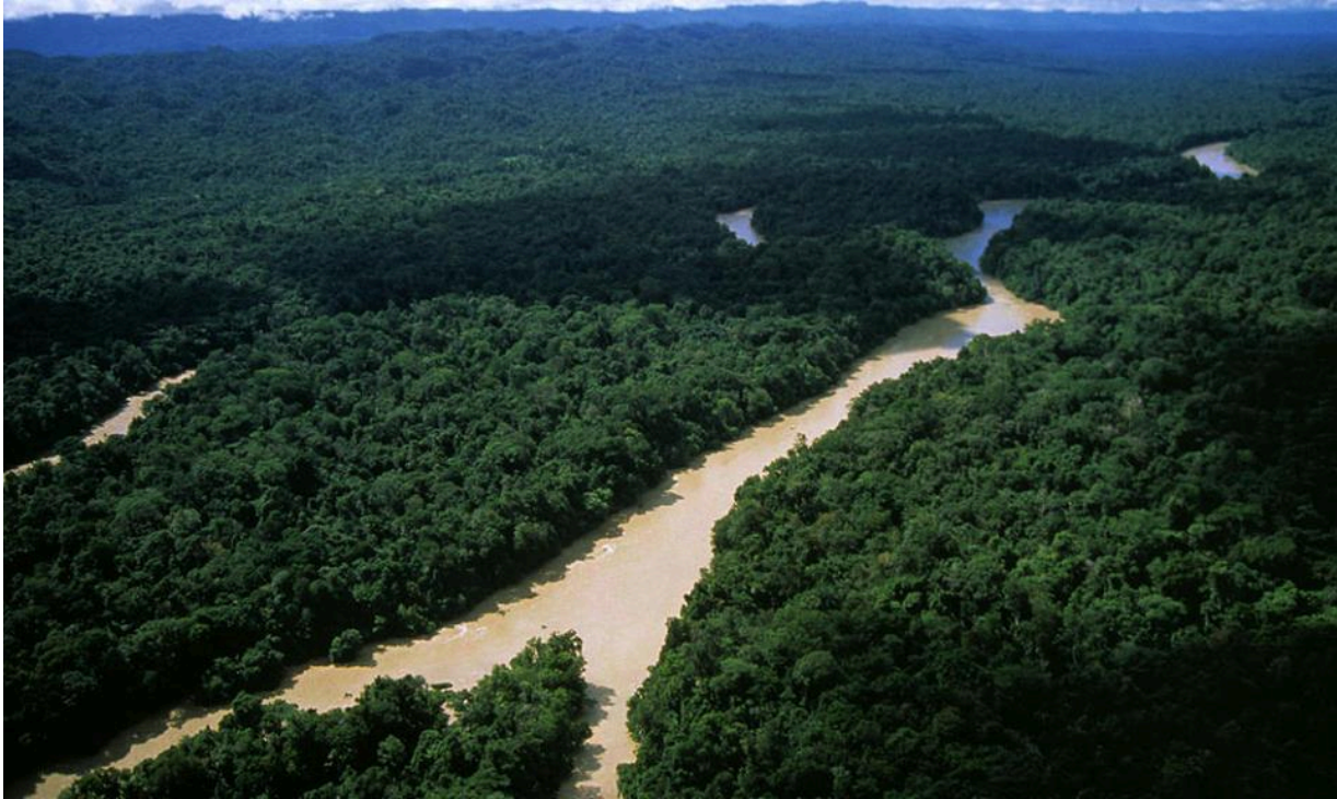
Virgin rainforest in Papua New Guinea.

Indigenous Rights are protected under the UN Declaration on the Rights of Indigenous People and Indigenous Rights is now a part of the negotiating text on REDD+ at the UNFCCC Conferences of the Parties.