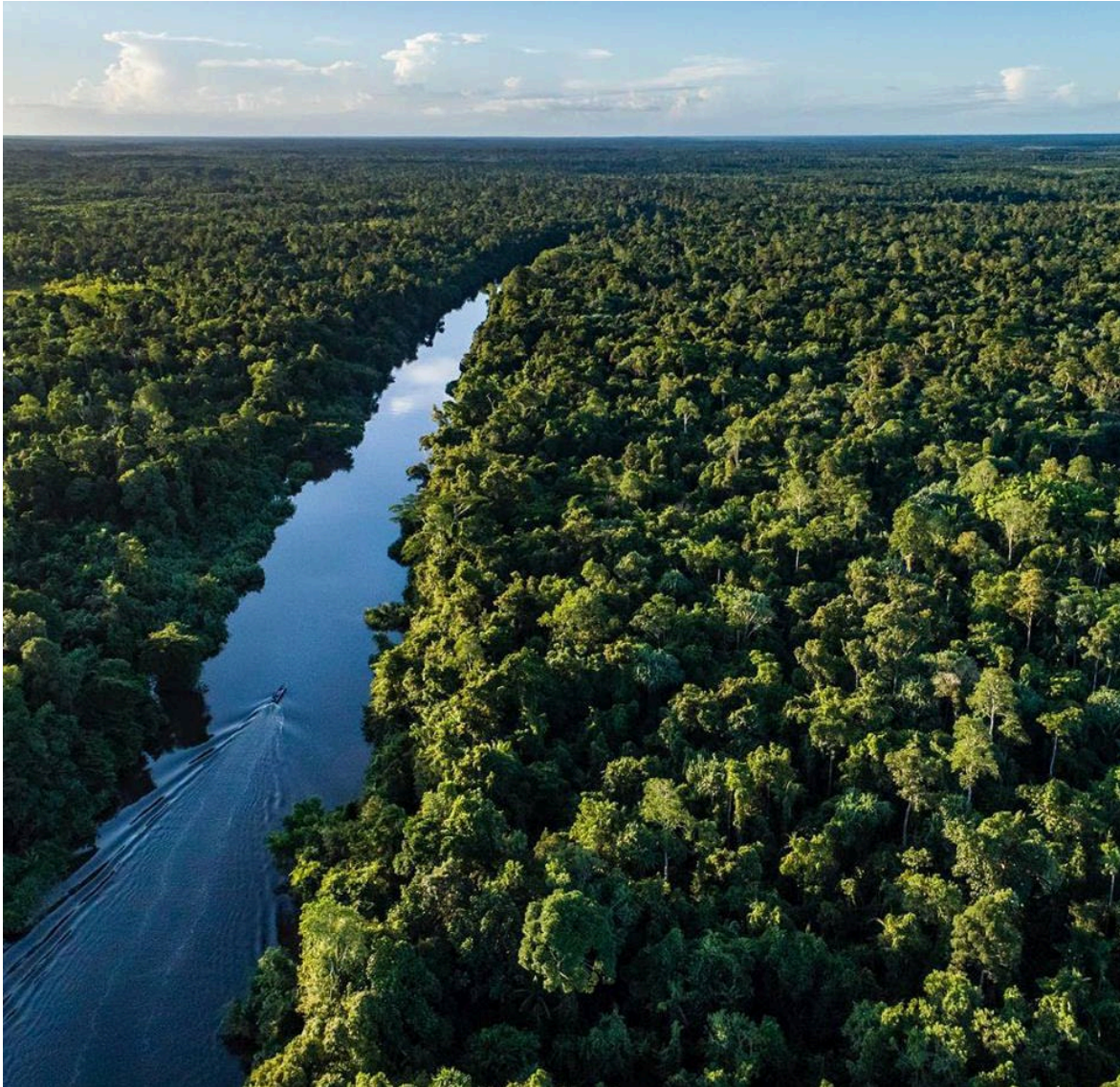
Untouched tropical rainforest in Papua New Guinea.